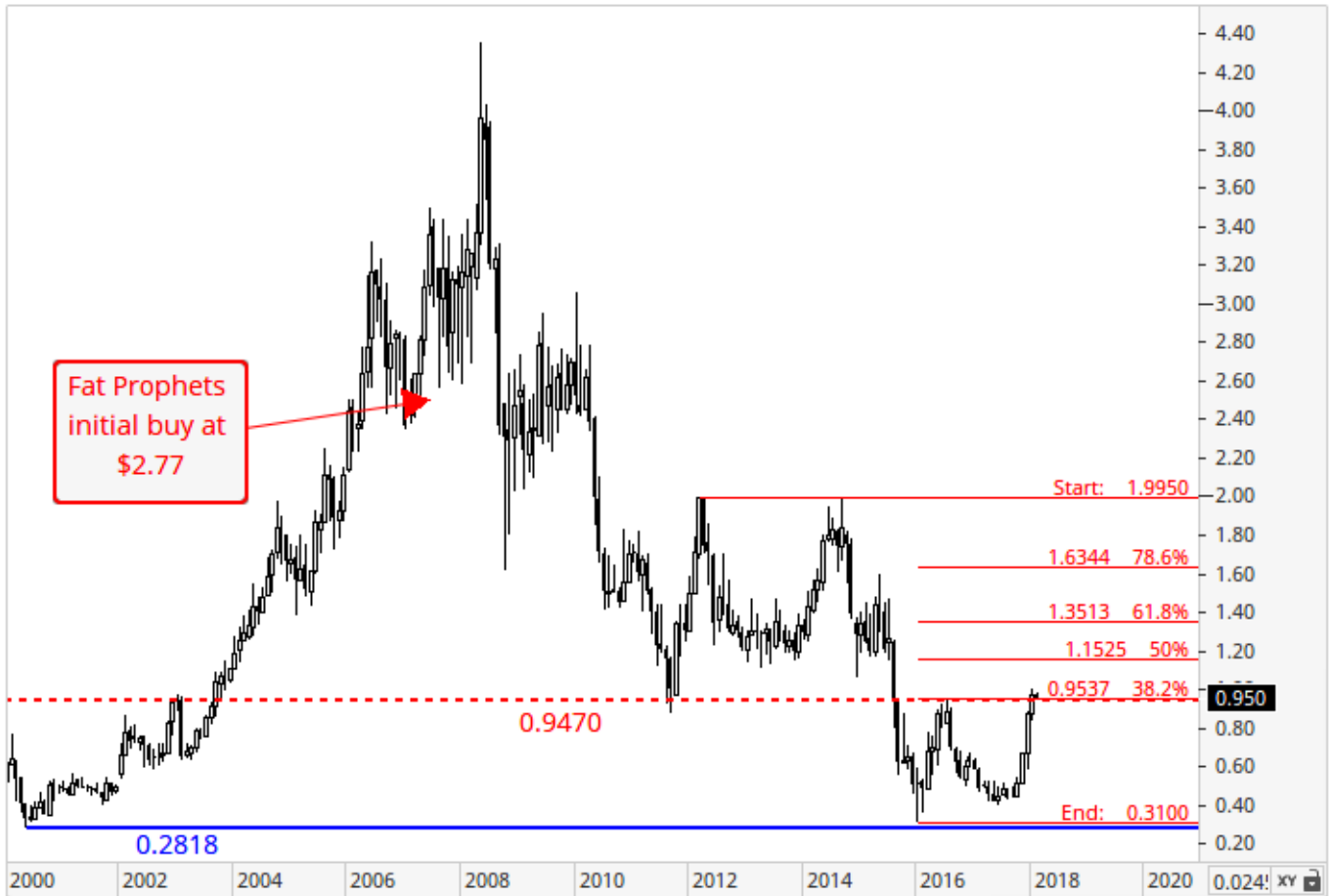
AWE Limited - AWE (ASX) - 1 Month CandleStick Chart - AUD

We reiterate our recommendation that Members who hold AWE in their portfolio should immediately accept the Mitsui offer.